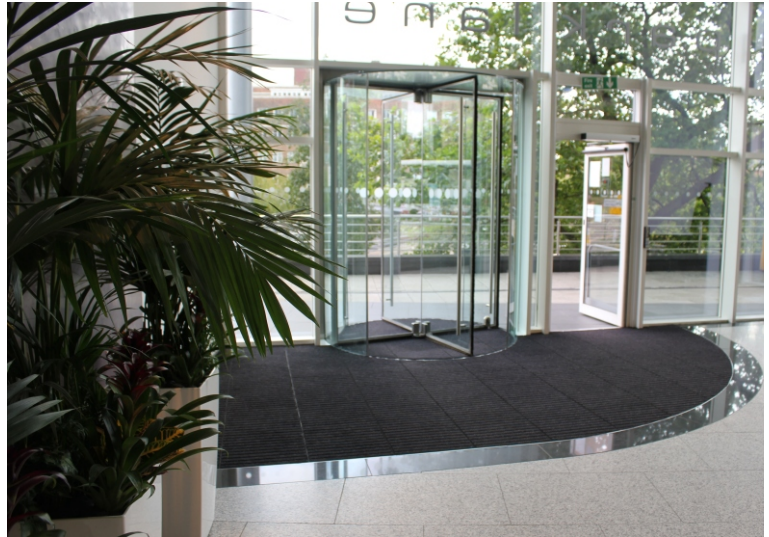
MATRIX installation incorporating curves and revolving door.

Matrix rubber entrance matting modules are manufactured to ISO9002 and conform to current BS8300 DDA regulations.